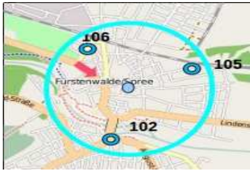
Fig. 4: Set of multiple potential sites

three potential sites are located (marked 105, 106 and 102). The proposed heuristic approach uses multiple methods and information from multiple sources to stepwise reduce the set potential sites to a single site. Additional information like hardware-type or neighboring sites is requested on demand