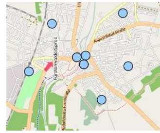
Fig. 3: Macro Deployment including three collocated sites

For future LTE-Advanced and “Heterogeneous Network” deployments, mixed deployments will be often used. The 3GPP started to define possible deployment scenarios and analyze the effects they cause [2]. Mixed deployments with layered cell structures are used as a capacity improvement at places with a high number of active users. The hierarchical cell setup is used to serve stationary users and fast moving users at the same time. Such a setup combines the benefits